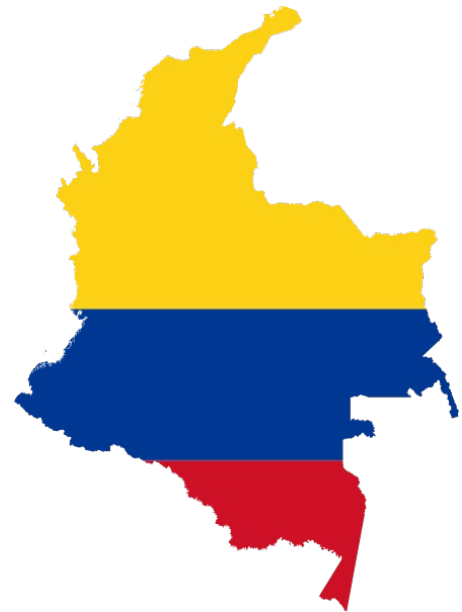
Colombia, with flag detail.