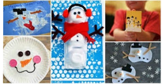
Snowman art projects

Interview someone in your family or community who is an immigrant. Invite them to speak to your class.