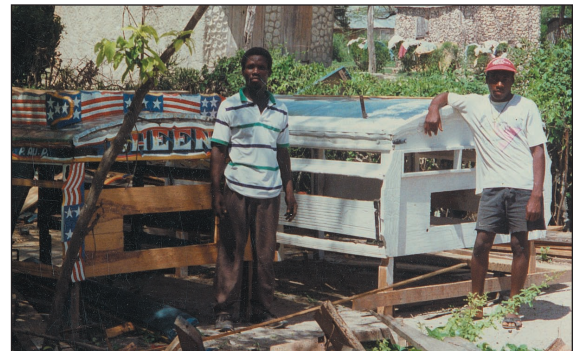
Tap-tap's being built and repaired in Haiti.