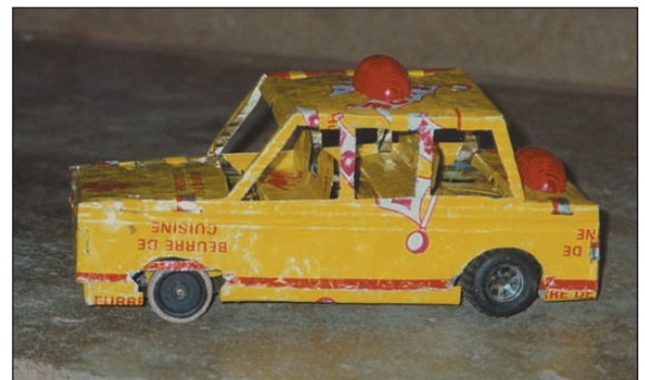
This toy tap-tap is made from yellow tin cans.