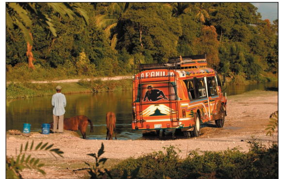
A tap-tap gets a "car wash" in the river.

Sasifi has a problem. She has lost her hat. What does she do? Does she solve her problem by herself or does she wait for someone to do it for her? How do you think Sasifi feels about herself?