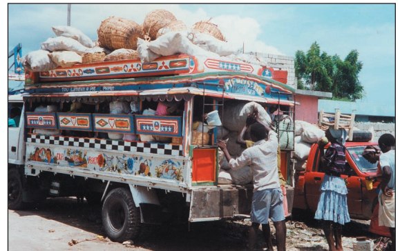
Tap-Tap's throughout Haiti.