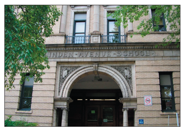
The Linden Avenue School was the setting for this story.