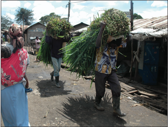
Jobs people do.

Beatrice’s teacher tells a proverb about the Hyena and the sheep. What is a proverb? Do you know any proverbs? What do they mean? Ask your parents and grandparents if they know any proverbs. Make a book of proverbs.