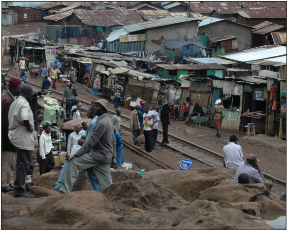
Kibera slum in Africa.

Kibera slum did not always exist in Nairobi. When people have trouble finding jobs and food in the countryside, they often move to the city for work. When too many people move to the city, there are not enough jobs and people cannot afford houses and food. What are some ways to solve these problems?