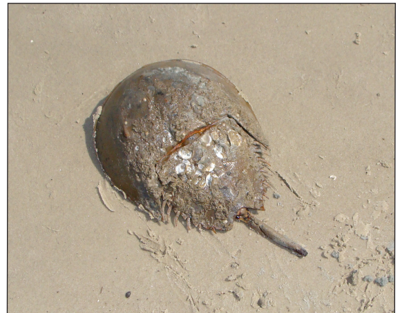
Starfish and Horseshoe Crab.