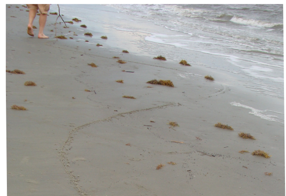
At the beach.