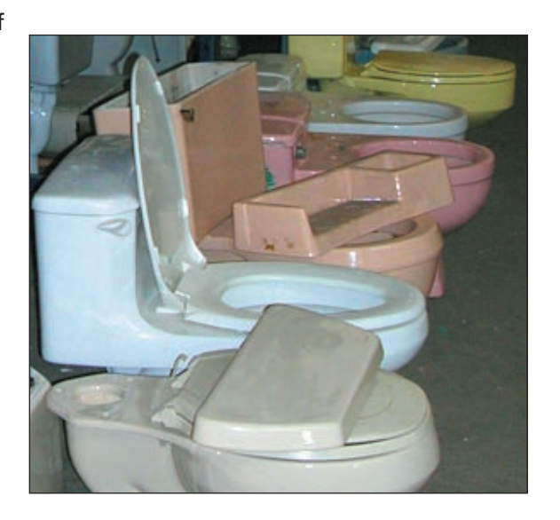
Saving, collecting and recycling materials like this are a theme in this book.