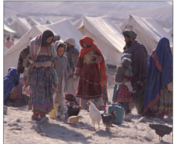
Refugees in a refugee camp in Pakistan.