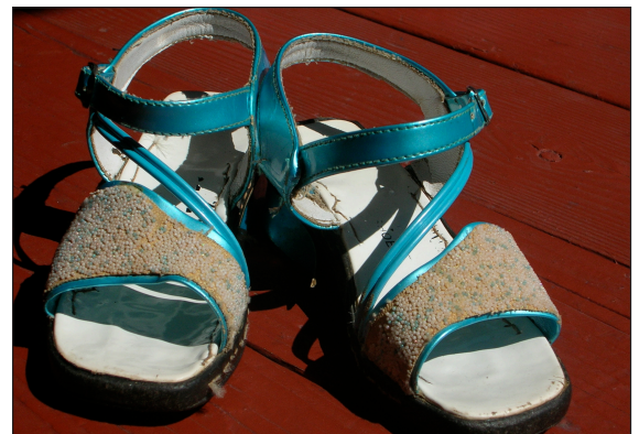
The shoes that inspired the story.