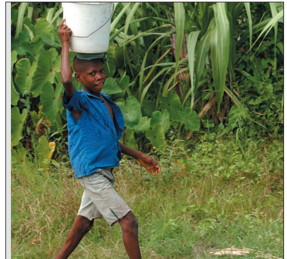
Facile had to carry water up the mountain everyday, much like this young boy.