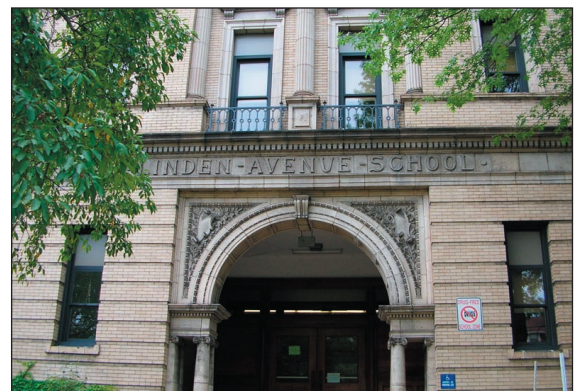
The Linden Avenue School was the setting for this story.